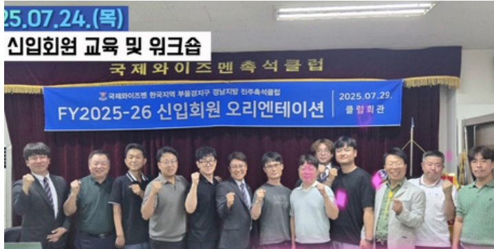
Jinju Beta-Chok Suk

Two clubs were highlighted as “Best Club Cases”: Jinju Beta-Chok Suk , which added 10 members while maintaining “Gold Club” status, and Hae Nam Ddang-kut Club , which grew through strong communication initiatives, including its “Dynamic Young Leaders Forum,” resulting in six new members. Through these reports and presentations of best practices, Y’s Men leaders in the Korea Area reaffirmed their goals and pledged renewed commitment to continued growth and development in the second half of the year.