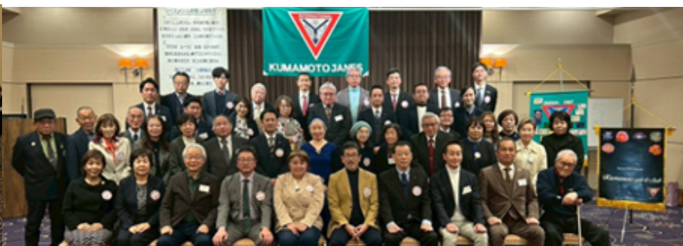
Kyushu District: Kumamoto Janes and Kumamoto N Spirit 13 January 2026, Kumamoto

Joint New Year celebration of Fuji and Fujinomiya Clubs, Fujisan District, 18 January 2026.