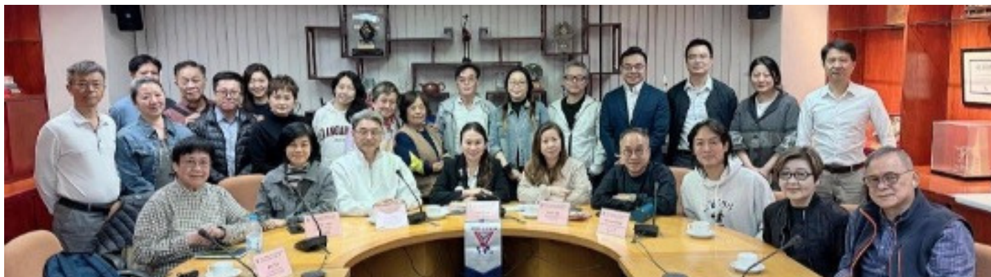
Hong Kong District Council Meeting, January 2026