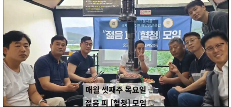
Hae Nam Ddang-kut Club